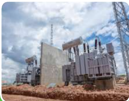
Electrical works: Chawama Substation