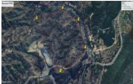
GRID Impact Study: Mulungwa 300MW CFTPP