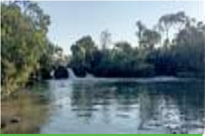
Northern Province Small hydro site